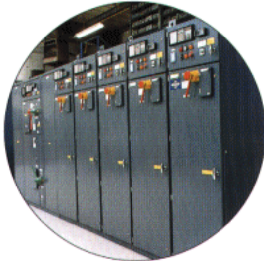
3.3kV Motor Control Centre

The name Igranic stems from the use of the rock granite in the formation of early resistors at the turn of the century and the Igranic of today whilst based in such tradition, looks forward to meeting future challenges head-on with commitment to continuing research and development.