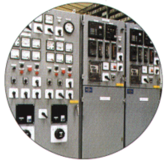
11kV Vacuum Circuit Breaker and Synchronising Instrumentation

The practical management team have extensive knowledge of control systems, industrial applications, manufacturing, commissioning and system maintenance, together with the self-motivation required to provide the personal service their clients have come to expect.